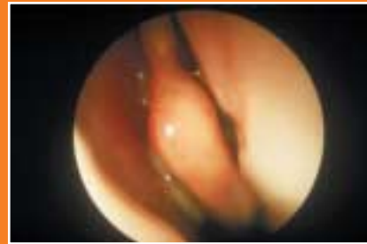
A patient with chronic sinusitis. The thick green mucus associated with a sinus infection can be seen draining into the nose.