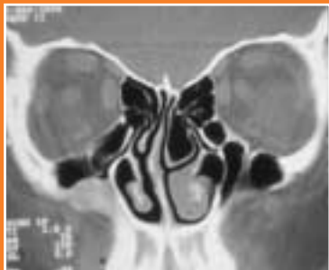
CT scan of normal nose and sinuses.

You may change your mind about the operation at any time, and signing a consent form does not mean that you have to have the operation.