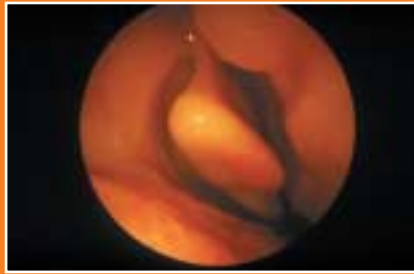
The view inside a 'normal nose'.

Normally the nose and sinuses produce a pint and a half of mucus secretions per day. These secretions pass normally through the nose picking up dust particles, bacteria and other pollutants along the way. This mucus is swept into the back of the throat by millions of tiny hair-like structures called cilia, which line the nasal cavity. The mucus moves into the throat and is swallowed. Most people do not notice this mucus flow because it is a normal bodily function.